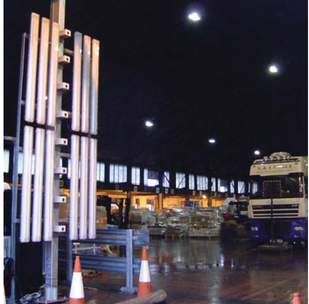
Automated barcode & package recognition system