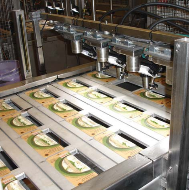
Inspection of best-before dates & print quality