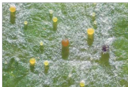
Powdery mildew on Norway maple, cleistothecia, Spot K LED, oblique reflected light, zoom 2.0x