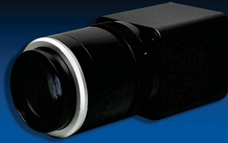
2.00 x 2.00 x 2.43 inches (50.8 x 50.8 x 61.7 mm)