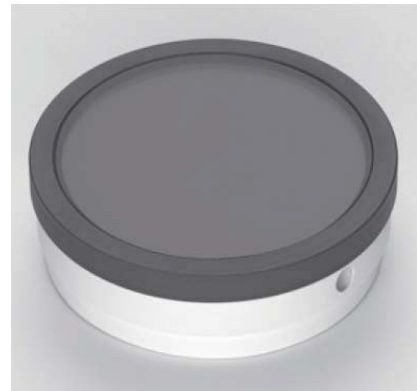
Transmitted light stage P/N 122 150 with Polarization filter P/N 158 500