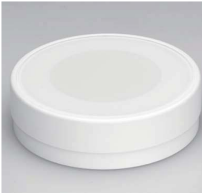
Transmitted light stage, P/N 122 150