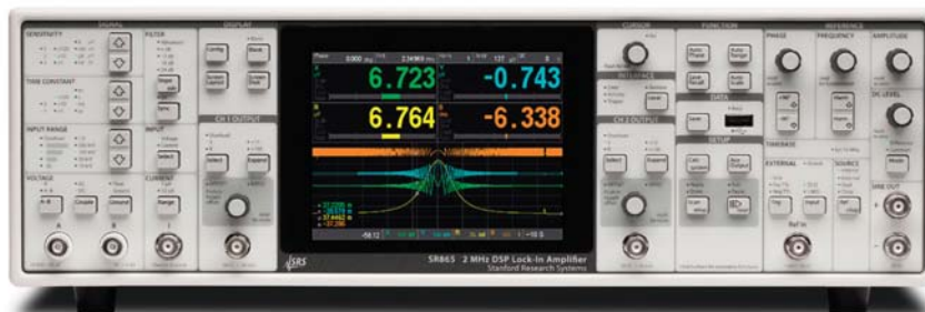
SR865A front panel