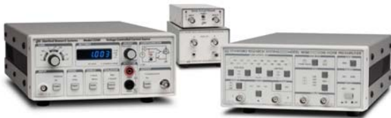
SRS current source and several SRS preamplifiers

The SR865A's built-in current amplifier represents a significant improvement over previous designs. The current input range is selectable from 1\ \mu\text{A} or 10\ \text{nA} . The 1\ \mu\text{A} range has 400\ \text{kHz} of bandwidth and 130\ \text{fA}/\sqrt{\text{Hz}} of noise, while the 10\ \text{nA} range offers 2\ \text{kHz} of bandwidth and 13\ \text{fA}/\sqrt{\text{Hz}} of noise.