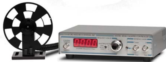
SR540 Optical Chopper

Synchronous filtering may also be selected at reference frequencies below 4\ \text{kHz} . The synchronous filter notches out multiples of the reference frequency and is extremely useful in making low frequency measurement where multiples of the reference frequency would otherwise show up in the lock-in output. Unlike previous designs the synchronous filter in the SR865A can be selected with no loss of output resolution.