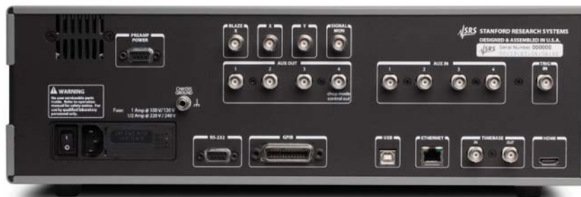
SR865A rear panel