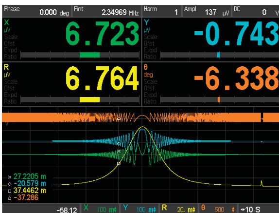
Large numeric readout with strip chart recording

The SR865A's effective dynamic reserve is simply the ratio of these two settings. For instance with a 10\ \text{nV} sensitivity setting and a 300\ \text{mV} input range the effective dynamic reserve of the SR865A is 3 \times 10^7 , or nearly 150\ \text{dB} .