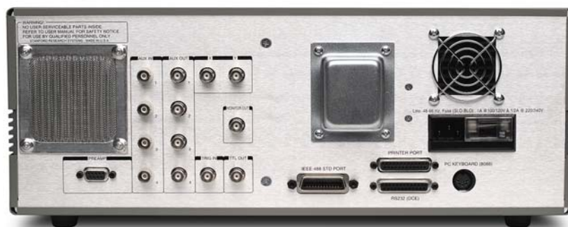
SR850 rear panel