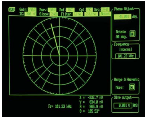
Polar plot display

defining an appropriate trace. Trace values can be displayed as a bar graph with an associated large numerical display, or as a strip chart showing the trace values as a function of time. Additionally, you can display polar plots showing the phasor formed by the in-phase and quadrature components of the