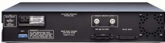
SR640 rear panel