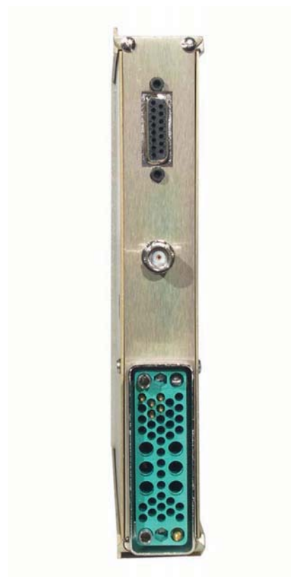
SR255 rear panel