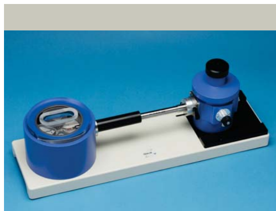
The Model 2550 Cryo Transfer Tomography Holder

The Turbo Pumping Station is available in multiple configurations for both FEI and JEOL