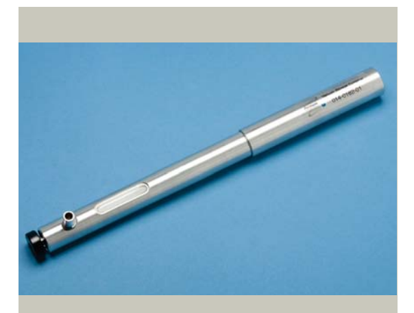
The Model 9010 Vacuum Storage Container