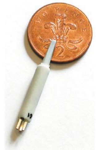
The illustration shows the main part of the magnetometer. The field sensing element is of sub-millimetre dimensions and is placed at the tip of the sensor.

This enables it to use an excitation frequency of several tens of MHz resulting in a sensor with a bandwidth of dc to 5MHz combined with low noise and wide dynamic range.