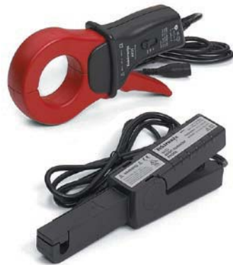
Illustration shows high performance current probes from Tektronix Inc.

Normally the probe provides a method of mechanically splitting the magnetic circuit to enable the conductor to be inserted. The position of the conductor within the loop has relatively little effect upon the measurement.